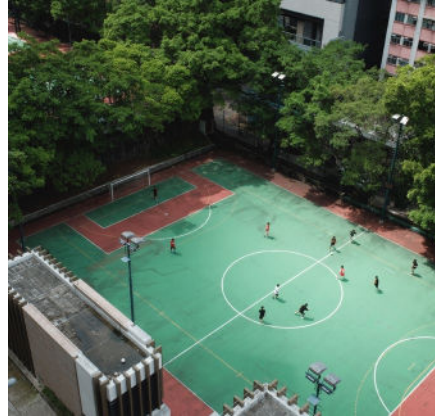
Tennis & football court