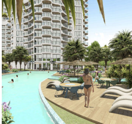
Family and Leisure Pool