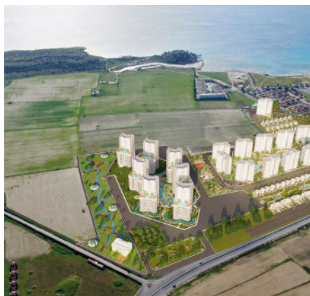
24/7 gated security