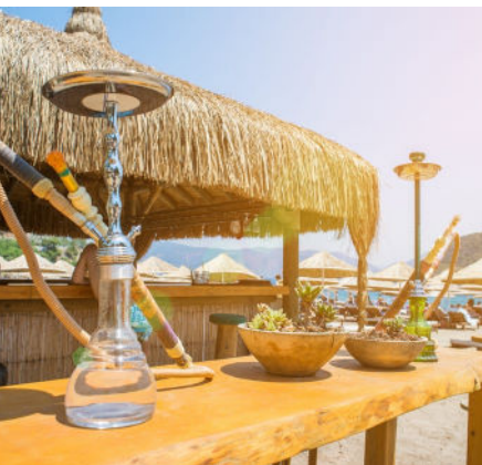
Shisha lounge & bar