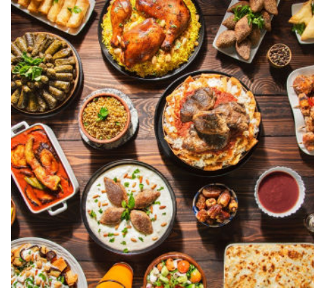
Authentic arabic restaurant