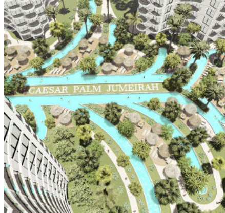
Unique palm pool