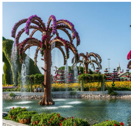
Fountain and Garden